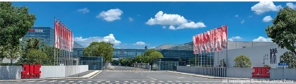
JIE Intelligent Drive Industrial Zone